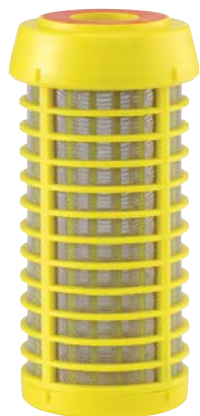
RAH cartridge 90 micron stainless steel net AISI 316