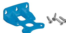
-S- wall bracket wall bracket screws