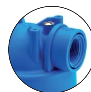
IN female plastic in/out threads 1/2", 3/4", 1", 1 1/4, 1 1/2