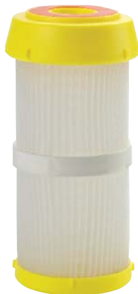
RSH cartridge 50 micron pleated polypropylene net