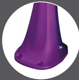
Stable and easy attachment