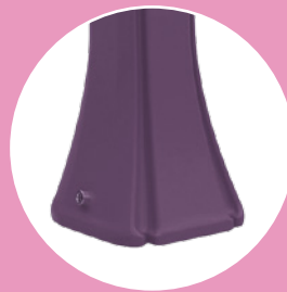
Stable and easy attachment