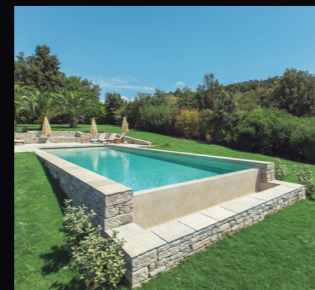
RENOLIT ALKORPLAN TOUCH Sublime