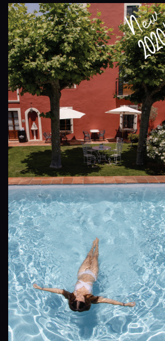
RENOLIT ALKORPLAN TOUCH Origin