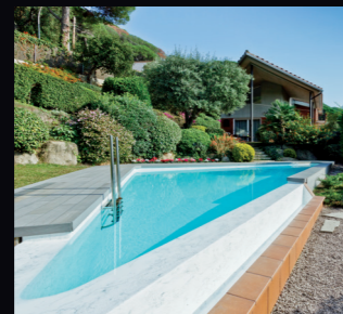
RENOLIT ALKORPLAN TOUCH Vanity