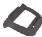
Control box base