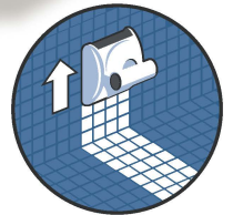
Floor & Wall Cleaning