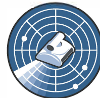
CleverClean scanning system