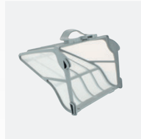
Filter canister Very thin, large-capacity rigid filter (5 litres)