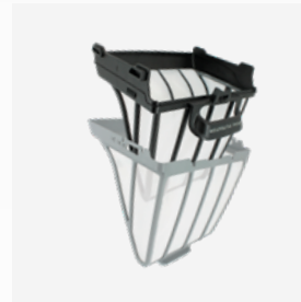
Main filter 150µ for Dual-Stage or stand alone use

Ultra-fine over filter 60µ for Dual Stage use