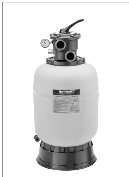
S166T Pro Series 16" Filter with Vari-Flo Control Valve