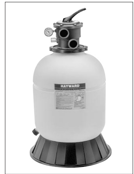
S180T Pro Series 18" Filter with Vari-Flo Control Valve