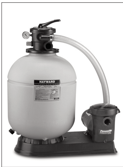
S210T93S Pro Series System