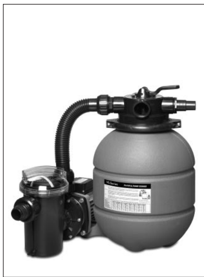
VL Series System