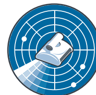
CleverClean™ scanning system