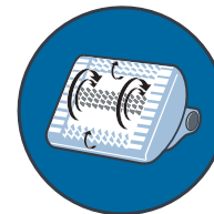
Extra Active Brushing