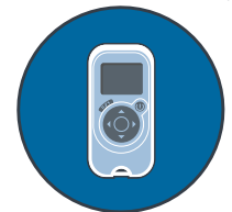
Remote Control Unit