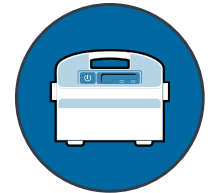
Full Filter Bag Indicator on Power Supply