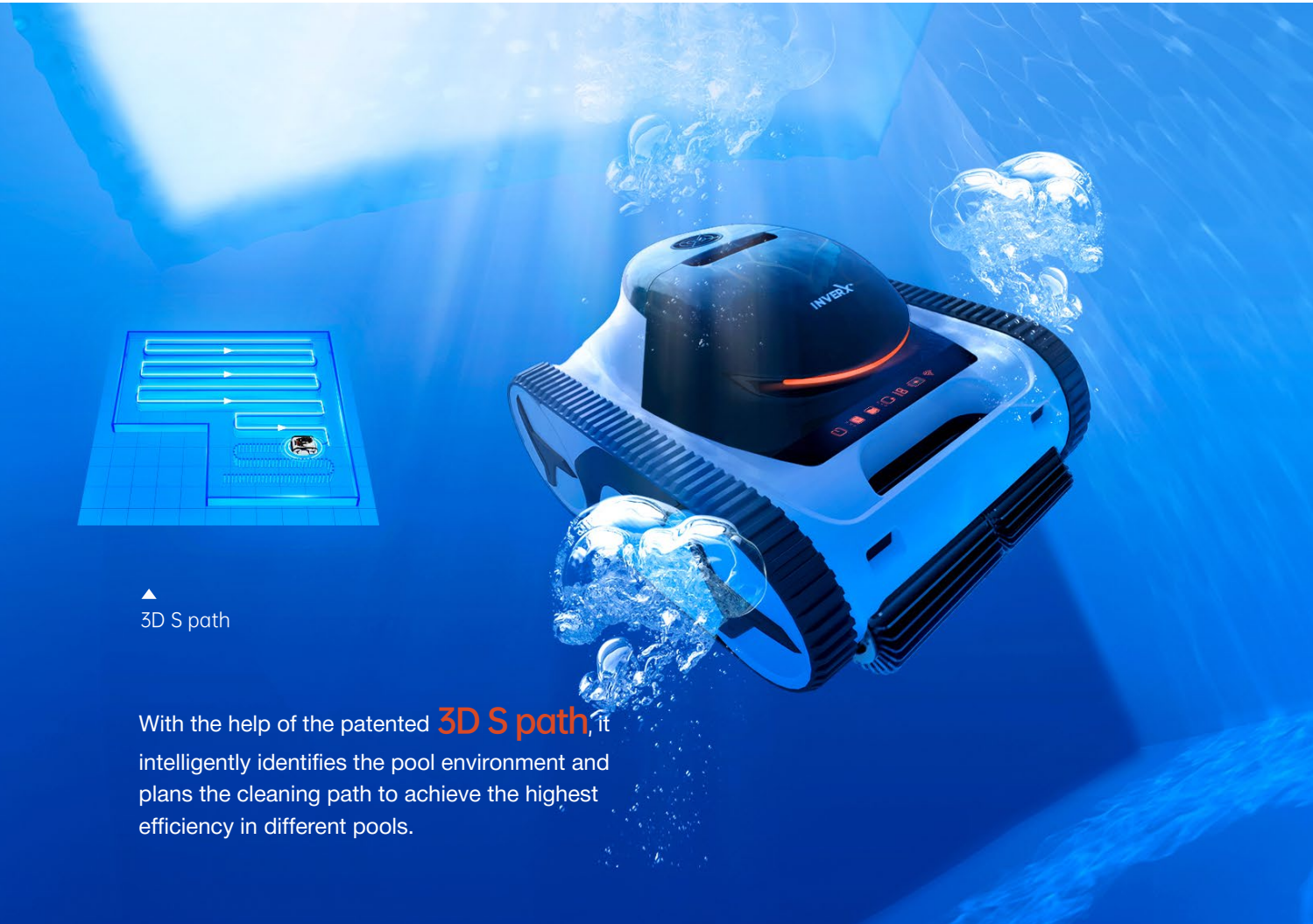
▲ 3D S path

With the help of the patented 3D S path , it intelligently identifies the pool environment and plans the cleaning path to achieve the highest efficiency in different pools.