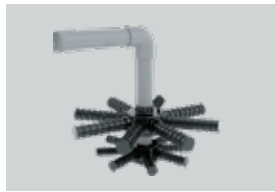
Dual Lateral System

with its 1.0m or 1.2m deep sand bed and dual laterals, offers an enhanced filtration and provides a high performance solution for residential and commercial pools and spas. It is UV-resistant and can operate under prolonged sunlight.