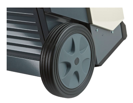
Big rubber wheels ensure safe and easy manoeuvring.

All units in the Dantherm CDT range are condensation dehumidifiers. An integral fan draws humid air into the dehumidifier and passes it through an evaporator. When the warm humid air meets the cold surface of the evaporator it condenses into water which is led to the water container. In the process the dry air is heated and returned to the room. The repeated circulation of air through the unit reduces the relative humidity, giving very rapid but gentle drying.