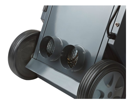
CDT 30 S and CDT 40 S are fitted with a 1 kW heating element, a high pressure fan and two duct spigots, allowing connection of two flexible air ducts Ø100, each up to 5 m long.

The mobile CDT dehumidifier can be supplied with a condensate pump cassette which is fitted instead of the water container. It pumps the condensate water to a drain. Using this condensate pump will enable your dehumidifier to run maintenance free, you will no longer have to empty a heavy reservoir filled with water. The lifting height is max. 3 m. The condensate pump cassette is available as accessory.