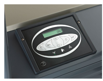
Digital display with integrated humidity control, energy counter, service status and easy fault finding allows optimal dehumidification.