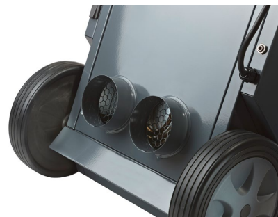
CDT 30 S and CDT 40 S are fitted with a 1 kW heating element, a high pressure fan and two duct spigots, allowing connection of two flexible air ducts Ø100, each up to 5 m long.

The mobile CDT dehumidifier can be supplied with a condensate pump cassette which is fitted instead of the water container. It pumps the condensate water to a drain. Using this condensate pump will enable your dehumidifier to run maintenance free, you will no longer have to empty a heavy reservoir filled with water. The lifting height is max. 3 m. The condensate pump cassette is available as accessory.