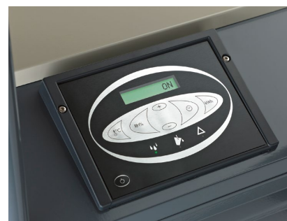
Digital display with integrated humidity control, energy counter, service status and easy fault finding allows optimal dehumidification.