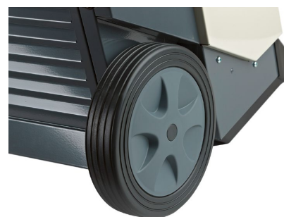
Big rubber wheels ensure safe and easy manoeuvring.

All units in the Dantherm CDT range are condensation dehumidifiers. An integral fan draws humid air into the dehumidifier and passes it through an evaporator. When the warm humid air meets the cold surface of the evaporator it condenses into water which is led to the water container. In the process the dry air is heated and returned to the room. The repeated circulation of air through the unit reduces the relative humidity, giving very rapid but gentle drying.