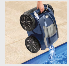
Lift System: Easy-to-use and lighter removal from the water