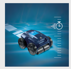
Personalised cleaning Sensor Nav Sytem™