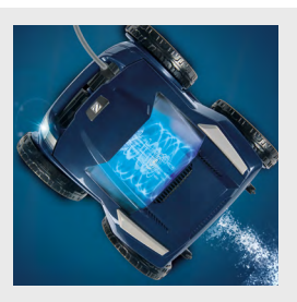
Patented Cyclone suction